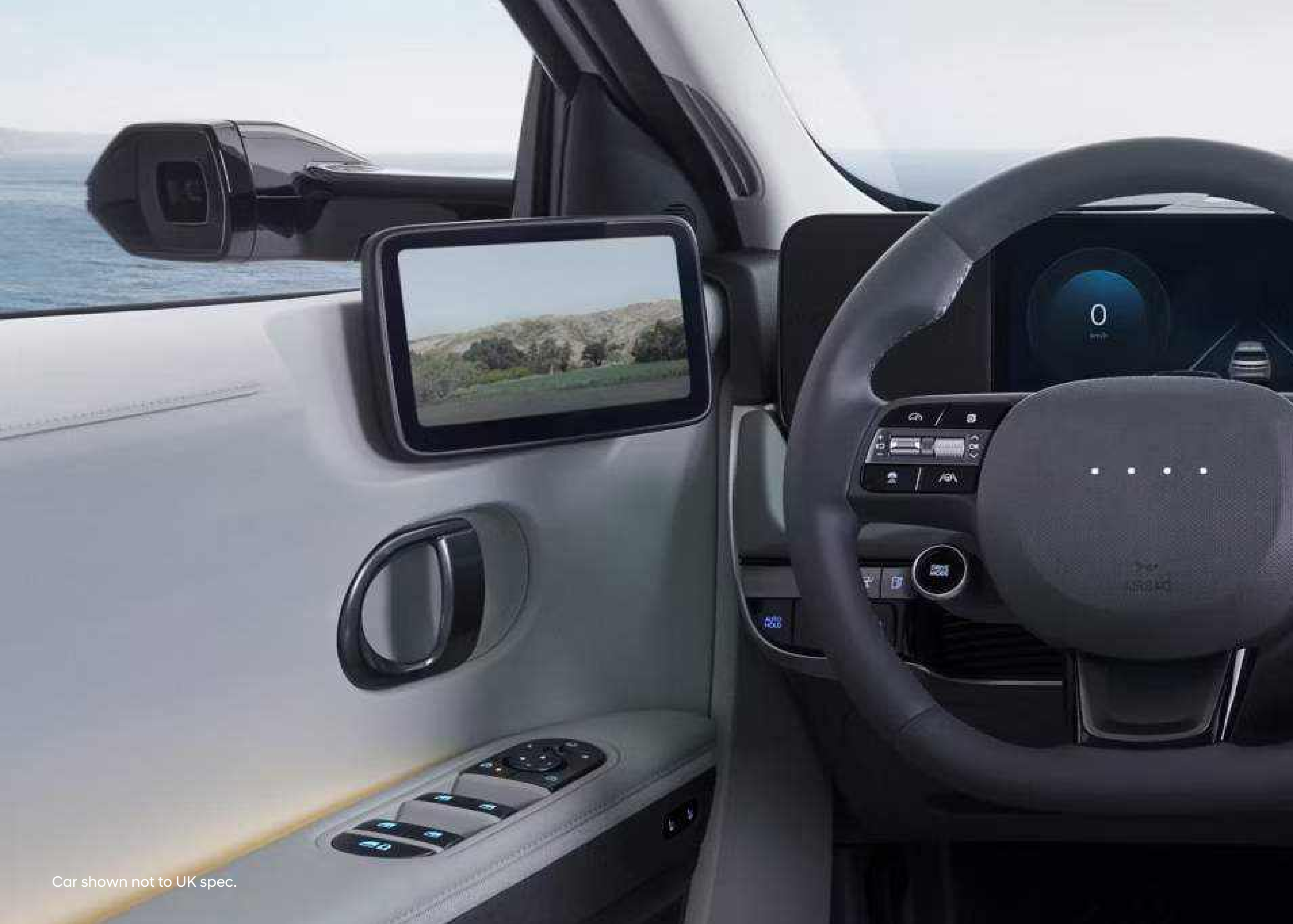
Car shown not to UK spec.