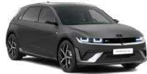
Ecotronic Grey (Matte)