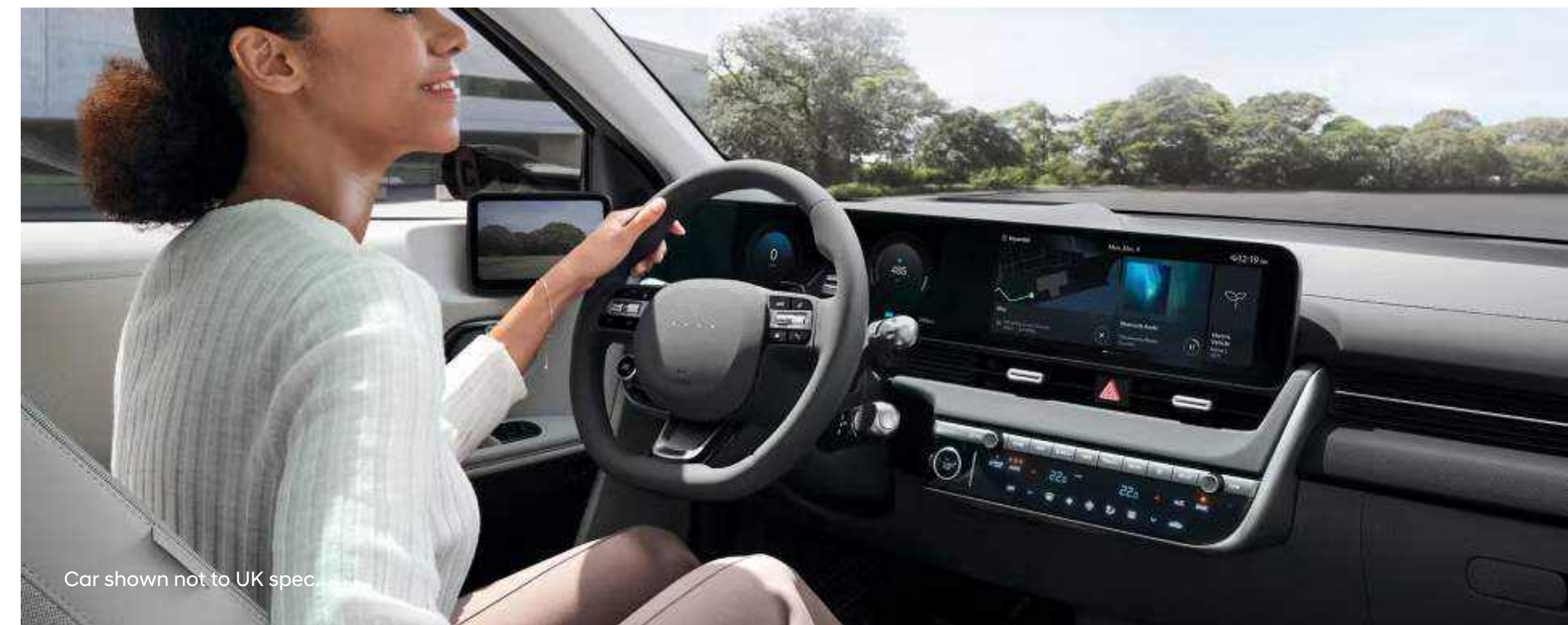
Car shown not to UK spec.

The updated IONIQ 5 is available with a range of camera-based monitoring systems that give you a better view of what's going on around you in traffic. Enjoy clearer, wider-angle visibility in all kinds of weather with Digital Side Mirrors and a Digital Centre Mirror. And for easier and safer parking, the Surround View Monitor gives you a bird's-eye 360-degree view of everything around your vehicle.