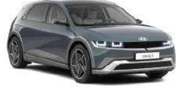
Digital Teal Green* (Pearl)