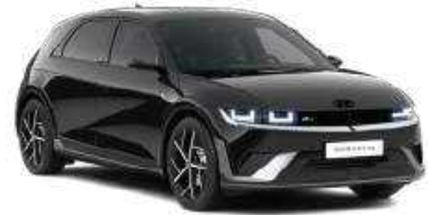
Abyss Black (Pearl)

Choose from a wide range of exterior colours to create an IONIQ 5 that is best matched to your personal style.