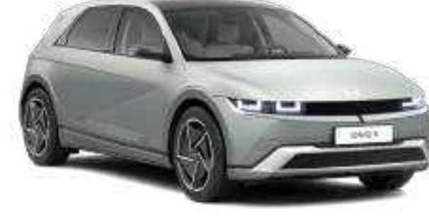
Celadon Grey* (Matte)

All colours are an additional cost option except from Ultimate Red (Metallic). *Colours only available on Advance, Premium and Ultimate.