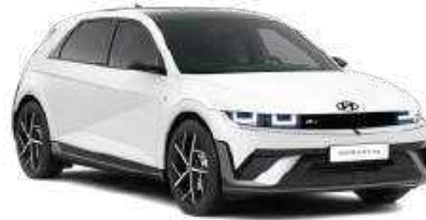
Atlas White (Matte)