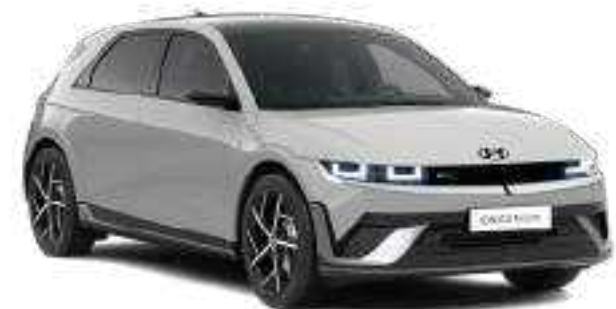
Cyber Grey (Metallic)