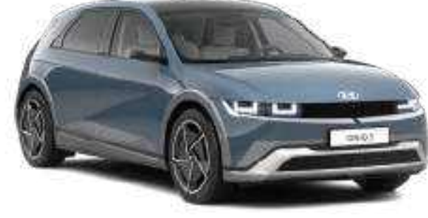
Lucid Blue* (Pearl)