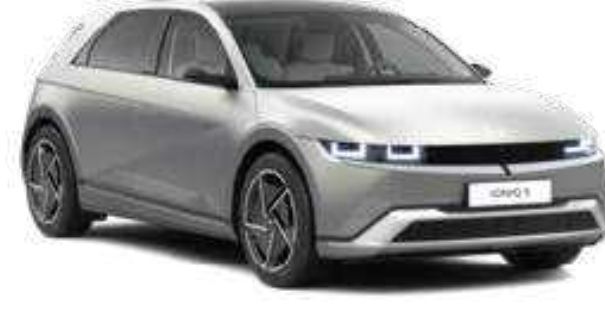
Gravity Gold* (Matte)