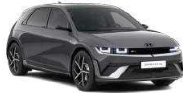
Ecotronic Grey (Pearl)