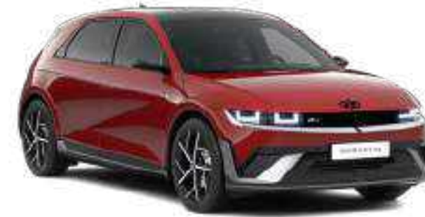
Ultimate Red (Metallic) (No cost option)