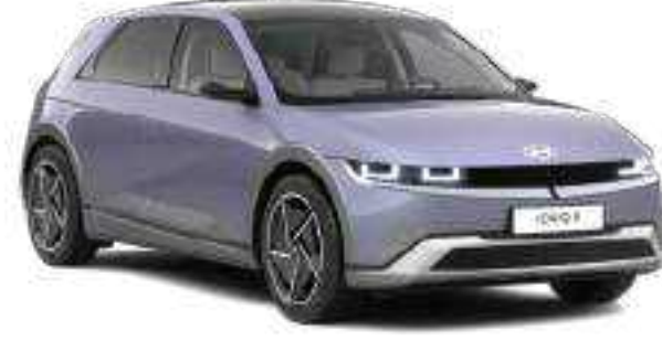
Meta Blue* (Pearl)