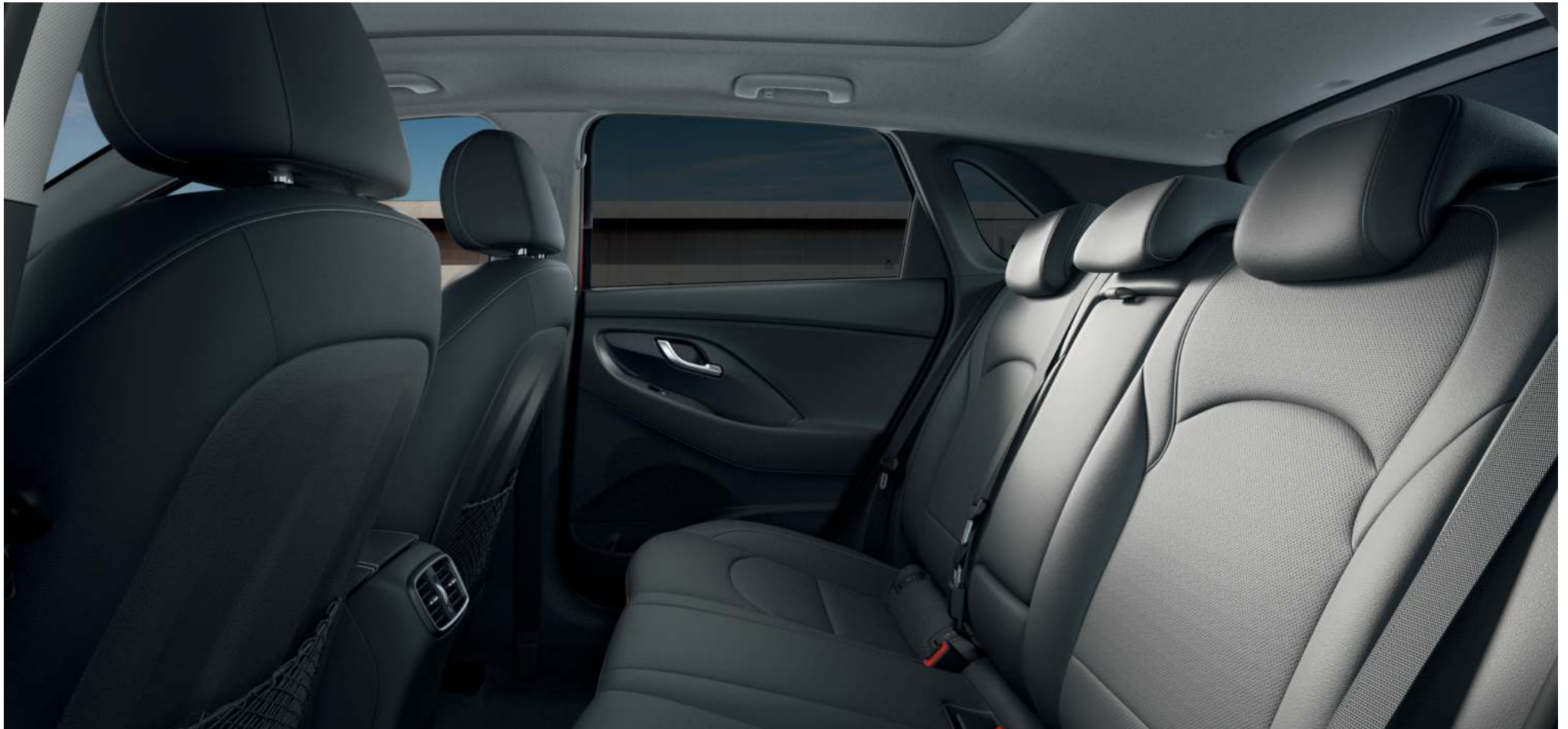
The seats are available in cloth, leather or a combination of both