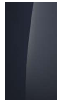
Sailing Blue (Pearl) (U2P)