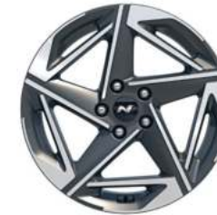
18" N Line alloy wheel