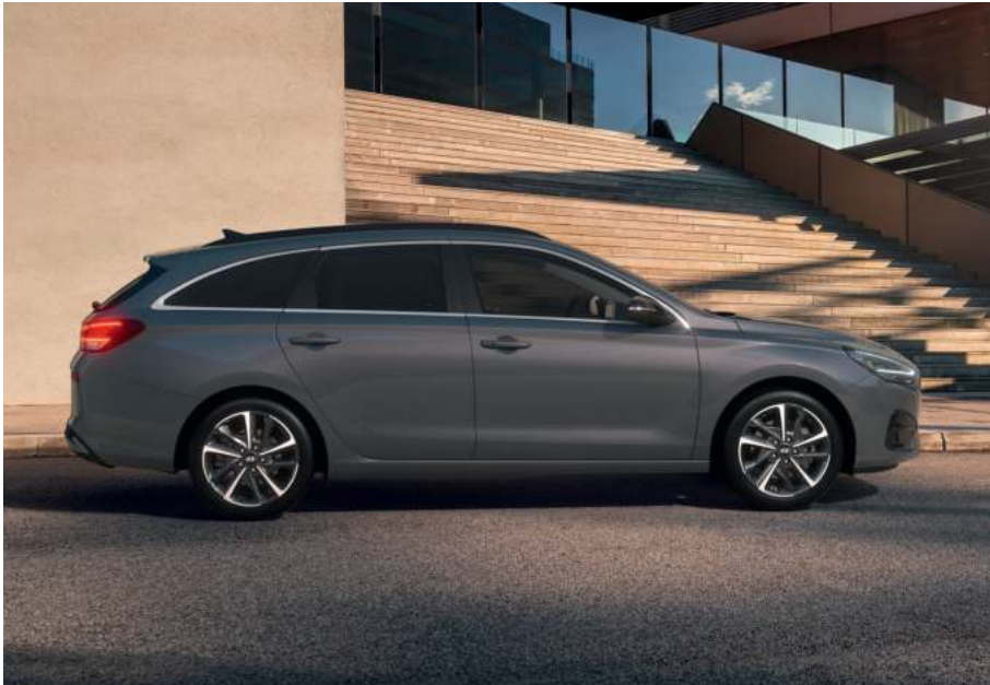
i30 Fastback i30 Wagon