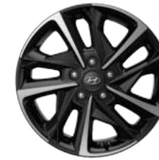
17" alloy wheel