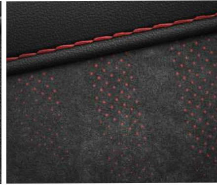
N Line - Leather/textile Suede