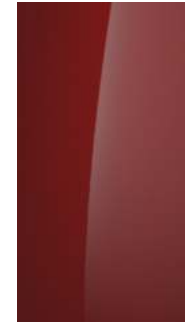
Ultimate Red (Metallic) (R1P)