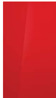
Engine Red (JHR)