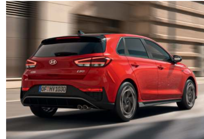
A dynamic rear bumper and black rear spoiler (Hatchback) Exclusive wheels