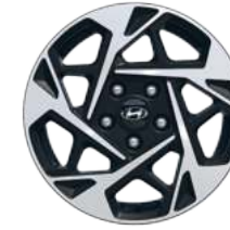
16" alloy wheel