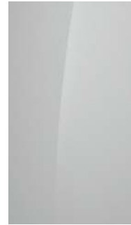
Serenity White (Pearl) (W6H)