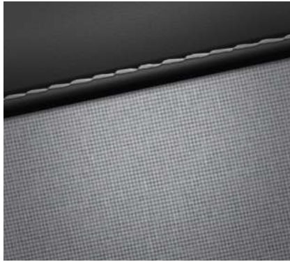
Comfort - Cloth Grey