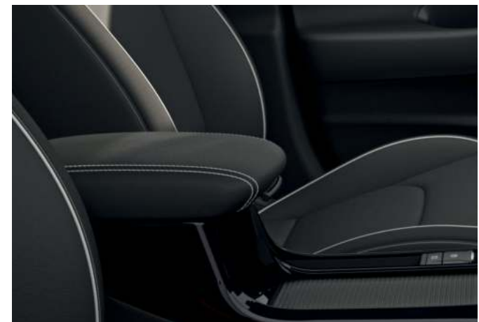
10.25" touch-screen display Sliding front armrest