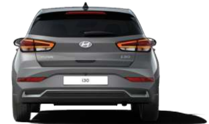
Wheel tread, rear (16"/17" tyres)