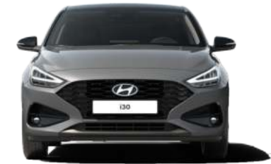
Overall width 1,795

Abbreviations: MT → manual transmission DCT → dual-clutch transmission