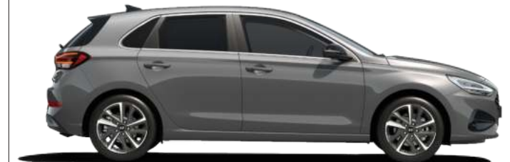
Overall Height 1,455 Overall length 4,340 Wheel base 2,650

Hyundai Motor Company https://www.hyundai.com/worldwide/en/ EU. LHD 2407 ENG. WD Copyright © 2024 Hyundai Motor Europe. All Rights Reserved.