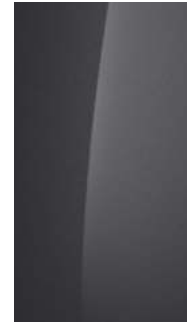
Ecotronic Grey (Pearl) (PE2)