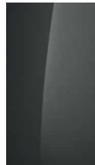
Cypress Green (Pearl) (T2P)