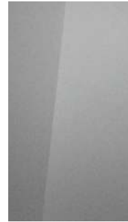
Shimmering Silver (Metallic) (R2T)