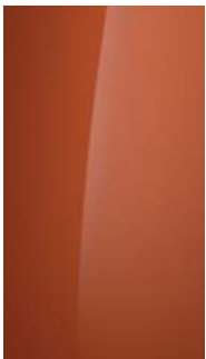
Jupiter Orange (Metallic) (PL2)