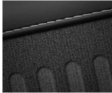
Premium - Cloth Black