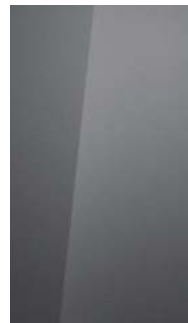
Shadow Grey (N Line only) (TKG)