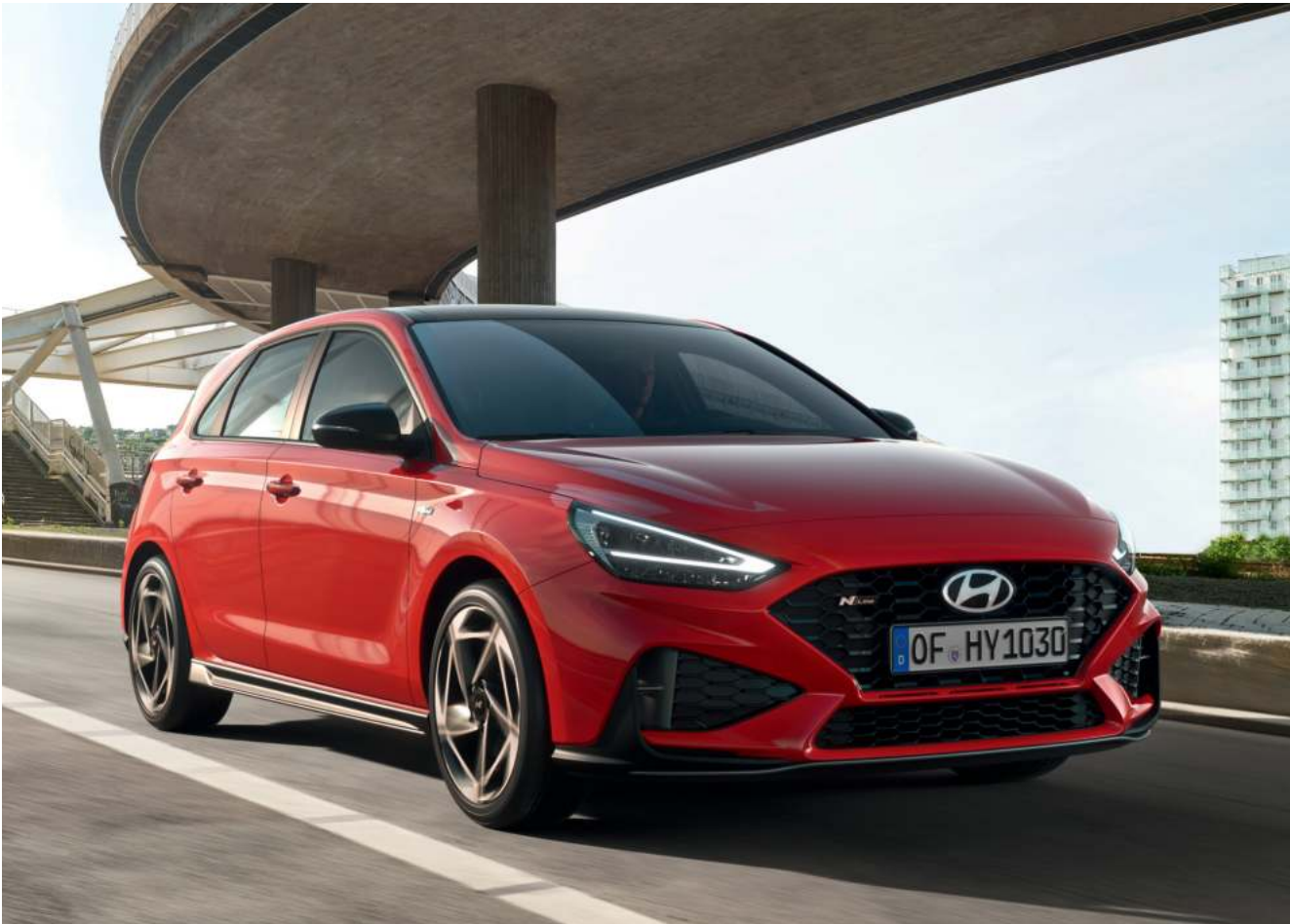
A bolder front supported by the V-shaped LED headlamp design

Elevate your i30 experience with the sporty N Line trim. A new grille mesh, dark metal inserts in the fog lamp housings and new side skirts with dark metal inserts create an unmistakable look that has more road presence than ever before.