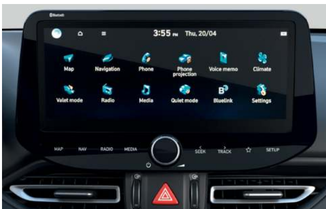
10.25" centre touch screen

Style meets substance in an intelligent interior that's designed around you and your needs. A 4.2" or 10.25" digital cluster and a 10.25" centre touch screen give you an overview at a glance, while USB-C and wireless charging and calling mean you're always connected, even if you're not plugged in.