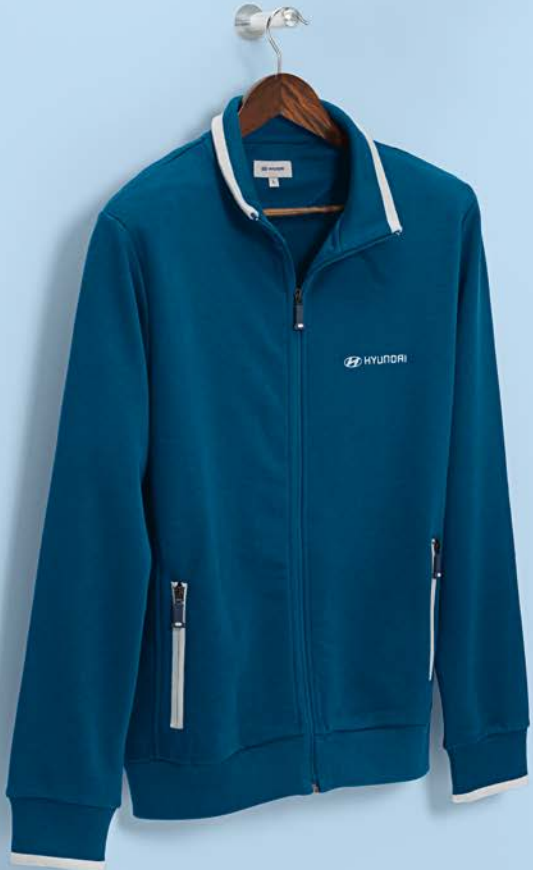
Sweat jacket, men 80% cotton, 20% polyester Customized puller, heart side and back logo embroidered Men, sizes S through XXXL

Two more perfect travel companions that will turn heads in the countryside as much as in the world's most urbane metropolises. Going for a hike or checking in for a flight, you can feel confident to do it in style.