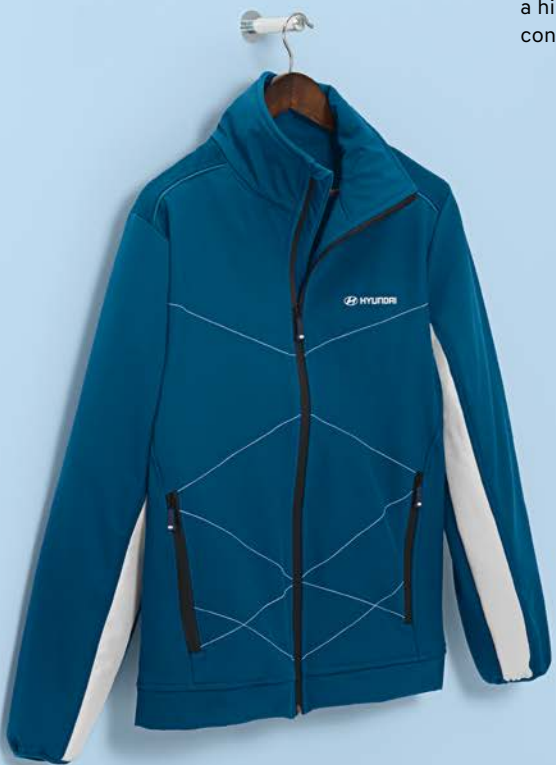
Softshell jacket, men/women 93% polyester, 7% elastane Customized puller, heart side and back logo in silicone print Men, sizes S through XXXL Women, sizes XS through XXL